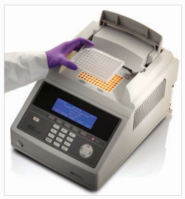
The GeneAmp<sup>®</sup> PCR System 9700 is an ultra-reliable, highly versatile thermal cycler designed for medium to high throughput DNA and RNA applications.

The GeneAmp PCR System 9700 offers a full selection of modular options and gold standard chemistries matched exactly to your application. The 9700 system provides the high-end performance you need, easily adapts to meet your lab's changing PCR needs, and helps you stay within your budget.